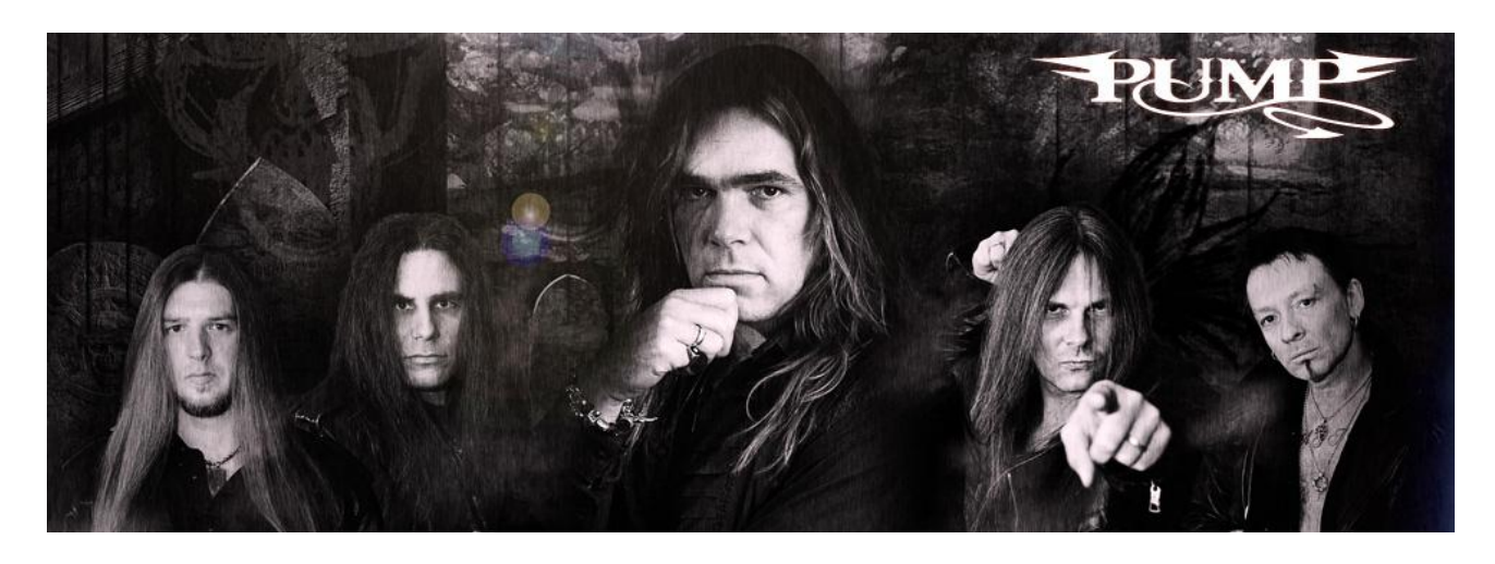
And now he is the new voice of the german kickass rockband PUMP!

The Solo Album was called "Get Ready" and the release date was September 2008. The second Solo Album was called "Evil's Back" released 2010.